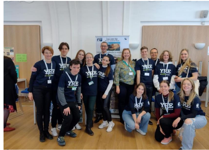
YRE students at the Youth Environment Education Congress in Prague in 2022