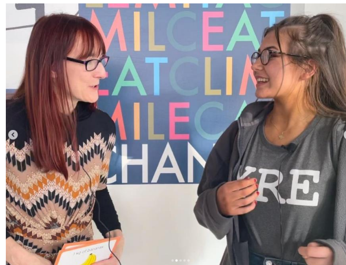
COP 27 in Glasgow in 2021